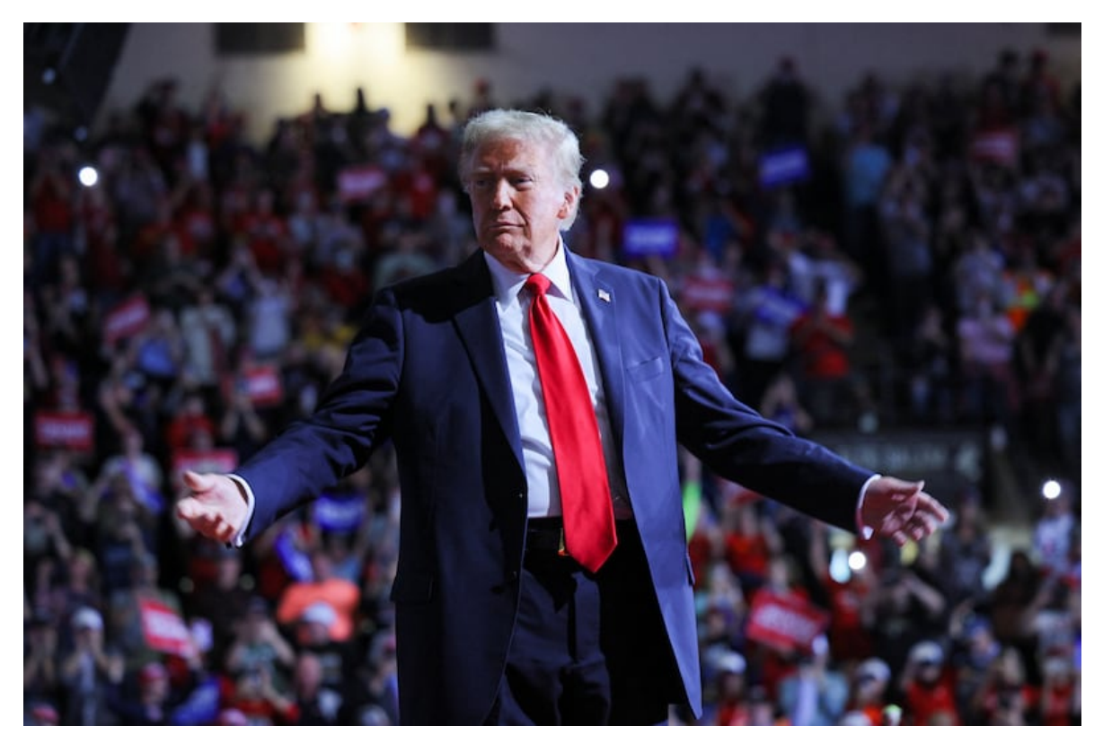
The new tapes shed light on a barely explored part of Trump's past, his long-term friendship with a man who would become one of America's most notorious sexual predators. Trump was in the last three days of campaigning on Saturday in Salem, Virginia.

He also claimed that while Trump has friends, he was at heart a friendless man incapable of kindness. And he alleged that Trump had undergone scalp reduction surgery for baldness and called himself "The Trumpster."