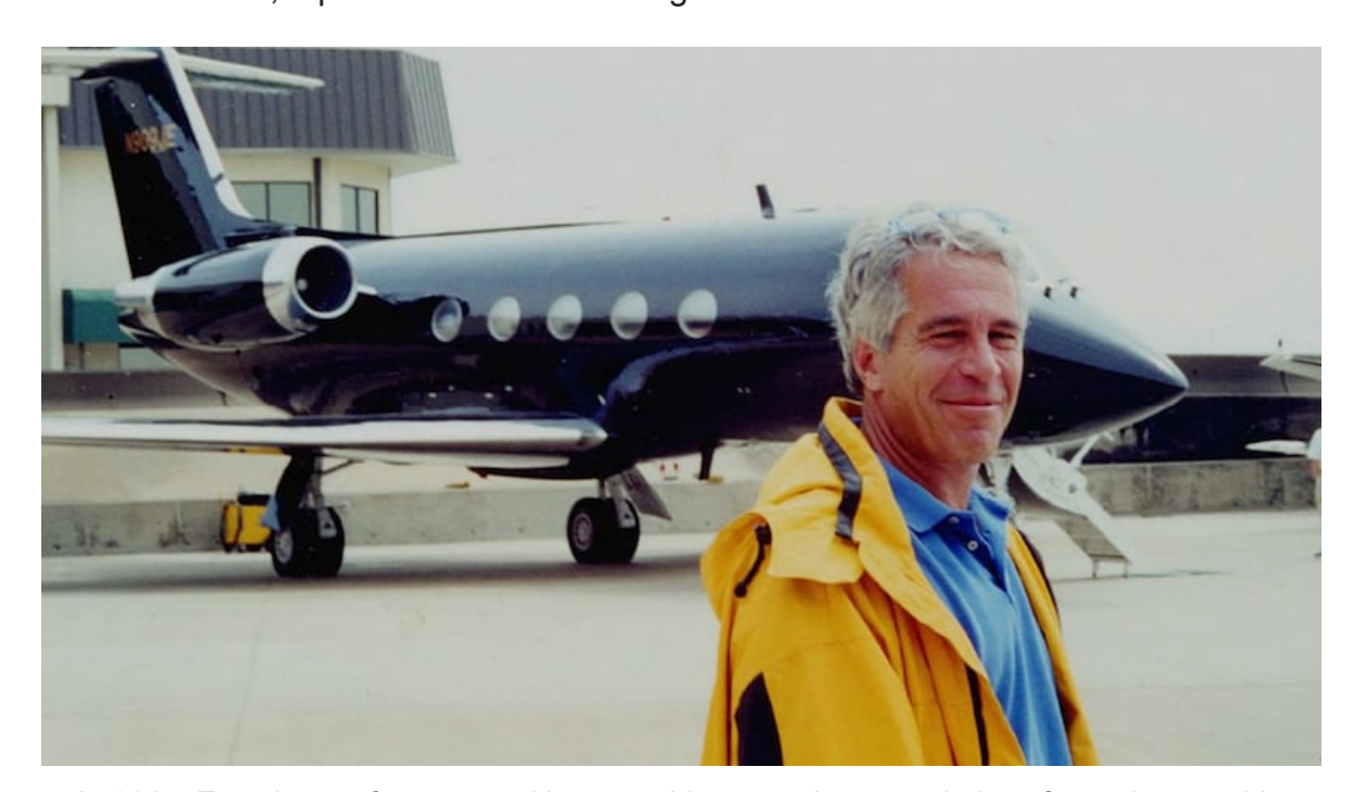
In 2017, Epstein was free to travel between his properties on a choice of two planes—this Gulfstream, and his Boeing 727, dubbed the "Lolita Express," on which he claimed Melania and Donald Trump first had sex.

The new recording offers extraordinary insights into Epstein, who in 2017 was shuttling freely on his two private jets between his <u>Manhattan townhouse</u>, his Palm Beach, Florida, estate and Little St. James, a private island in the Virgin Islands.